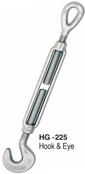
HG -225 Hook & Eye

Meets the performance requirements of Federal Specifications FF-T-791b, Type 1 Form 1 - CLASS 6, and ASTM F-1145, except for those provisions required of the contractor. For additional information, see page 452.